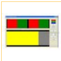
2. Easy Configuration