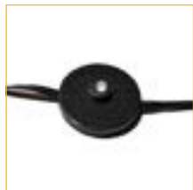
1. LED String