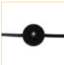
2. LED Sockets