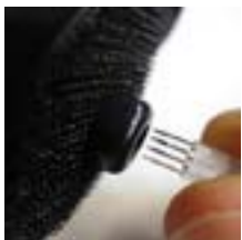
1. Chameleon LED