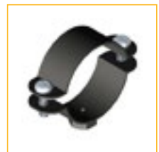
18. Pipe Clamp