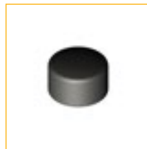
11. Protective Cap Alu-Pipe