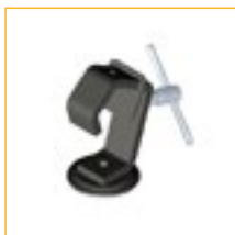
20. Hook Clamp 50 kg