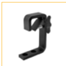
21. Hook Clamp 60 kg