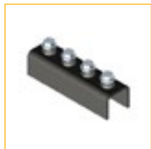
7. Joiner Profile