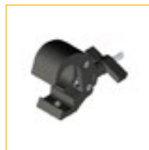
23. Hook Clamp 250 kg