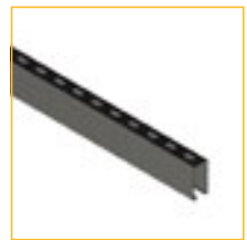
6. Construction Profile