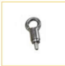
3. Loop Adjuster GR25