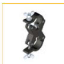
27. Turn Coupler 750 kg