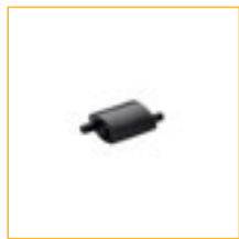
1. Quick System Adjuster

A variety of couplers and clamps for hanging curtains. Choose from these sturdy and practically designed accessories for rigging and suspension for all weights of stage drapes and theatre curtains.