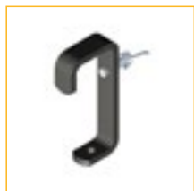
19. Hook Clamp 40 kg