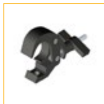
22. Hook Clamp 100 kg