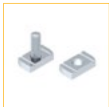
13. Channel Bolt M10 Channel Nut M10