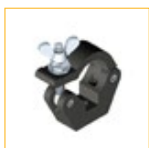
25. Half Coupler Clamp 750 kg