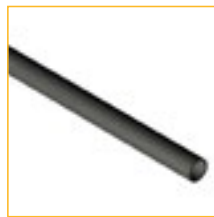
4. Construction Tube