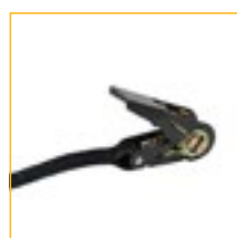
28. Ratchet Fastener