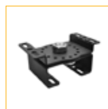
29. RotoDraper Fix