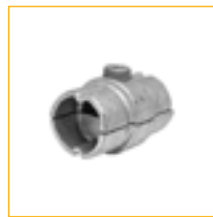
5. Inner coupler Construction Tube