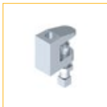
15. Girder Clamp