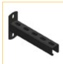
17. Wall Bracket