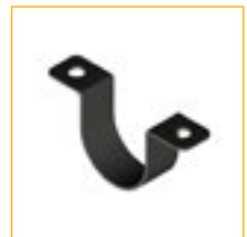
12. Pipe Bracket