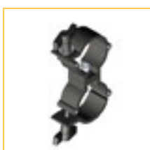
26. Turn Coupler 75 kg