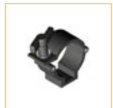
24. Half Coupler Clamp 75 kg