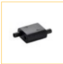
2. Quick System Adjuster