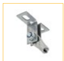
30. Swiveling Ceiling Fixing Plate M10