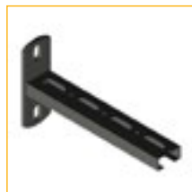
16. Wall Bracket